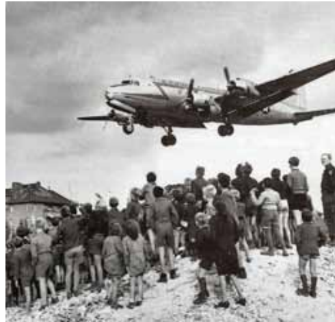
Berliners watching a C-54 land at Tempelhof airport