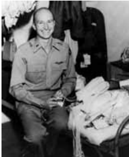
Col. Halvorsen in 1948

In 1948, Soviet dictator Joseph Stalin imposed a blockade on the western part of Berlin in an attempt to drive the Western Allies out of the area and grab the entire city for himself. The blockade prevented U.S., British and French forces from transporting by road the supplies needed to sustain the Berlin population under their control. In response, the Western Allies came up with a bold, never-before-attempted plan to break the blockade by supplying the people of Berlin entirely by air. Over the course of more than a year, over half a million flights delivered over two million tons of food and supplies to the beleaguered city. Of the many pilots that participated in this immense effort, Army Air Corp Colonel Gail Halvorsen became well known for his efforts in dropping chocolate and other candy to the children of Berlin. Operation "Little Vittles" eventually dropped more than 21 tons of candy during the airlift. Colonel Halvorsen was in town recently to speak as part of Northern Kentucky University's Projekt Mauer, and took time out to visit our museum.