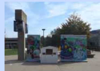
Replica of the Berlin Wall and Checkpoint Charlie on the NKU campus