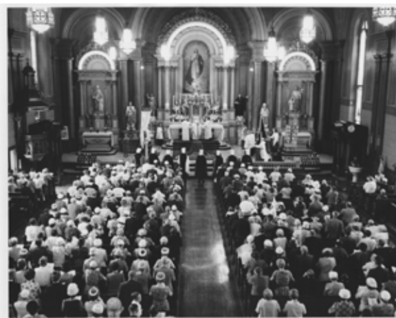
The German Mass returns to Old St. Mary's, Easter Sunday, 1962